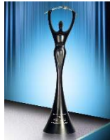
Elektra Award 2005