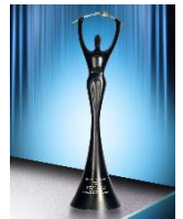
Elektra Award 2005