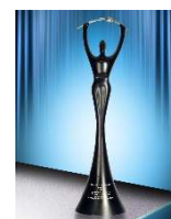
Elektra Award 2005