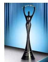
Elektra Award 2005