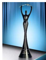
Elektra Award 2005